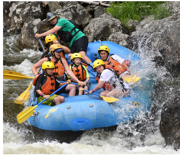
Outdoor adventure camp, Charlemont Mass

In 2019, 300+ people participated in more than a dozen camps including sleepaway and family camps, young adult and adult retreats, surfing, sailing, outdoor adventure, and therapeutic horseback riding. Amid fun and recreation. participants make friends and build community.